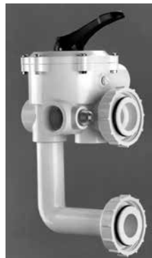
Multiport Valve Kit 261055