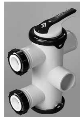
FullFloXF Backwash Valve Kit 263080

See page 576, 578–580 and 584–585 for replacement parts.