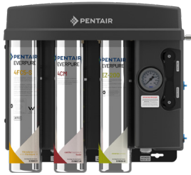
EZ-RO 200/2G-BL wall mount