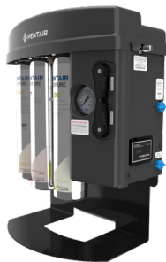
EZ-RO 200/2G-BL with optional floor stand bracket