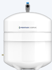
2-gallon hydropneumatic tank