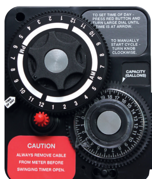
3210 TIMER METERED DELAYED REGENERATION