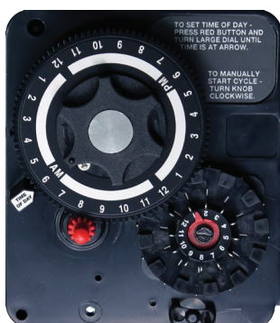
3200 TIMER TIME CLOCK