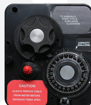
3220 TIMER METERED IMMEDIATE REGENERATION