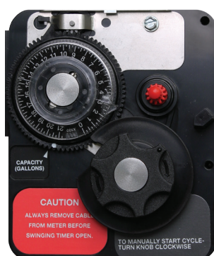
3260 TIMER METERED IMMEDIATE REGENERATION (TWIN TANK ONLY)