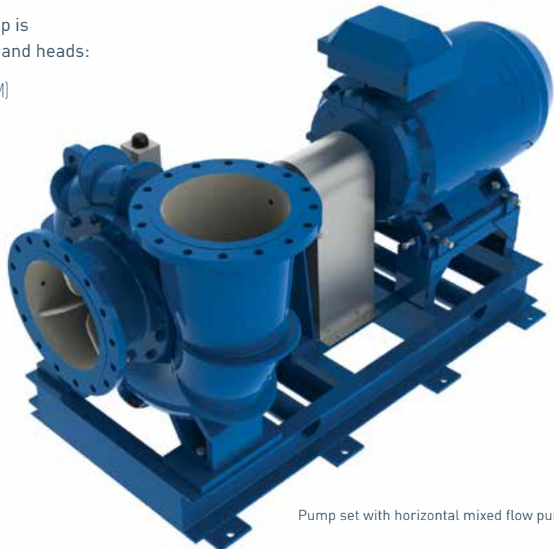
Pump set with horizontal mixed flow pump