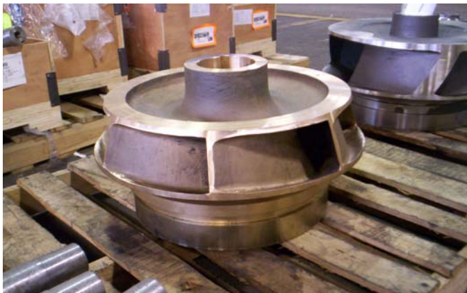
38HOH impeller cast in SAE 40 bronze

This is known down south as “Layne Bronze” because of its wide success in Florida, Georgia, and Alabama well pumps where high salinity is present. SAE 63 also has an excellent history in seawater applications along the Gulf and in Hawaii. It is one of the approved materials for the Aurora vertical turbine seawater fire pumps. SAE 63 is used for castings as well as bearing material if the pumping fluid may be connected to potable water.