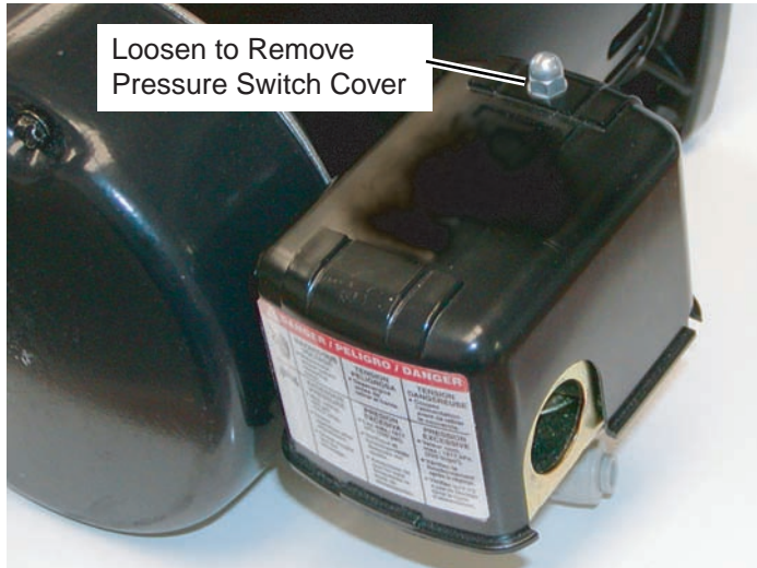
Figure 1: Pressure Switch Location

The starting and stopping of the pump is controlled by the pressure switch.