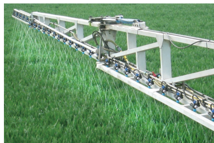
Advanced fertilizer nozzle capable of both pre and post emerge fertilizer applications.