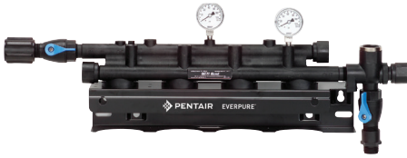
QC7I Quad Parallel Head: EV9336-11

FILTER HEAD EXCLUSIVELY FOR EVERPURE REPLACEMENT CARTRIDGES