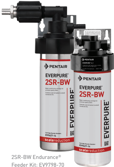
2SR-BW Endurance® Feeder Kit: EV9798-70

EXPAND YOUR WATER FILTRATION SYSTEM WITH THIS SCALE INHIBITOR FEEDER SYSTEMS