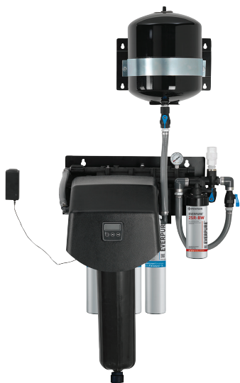
Endurance High Flow Triple: EV9437-41

ALL THE BENEFITS OF THE ENDURANCE PLATFORM PLUS ULTRAFILTER MEMBRANE-BASED PRETREATMENT