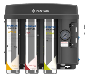
EZ-RO 200/5G wall mount