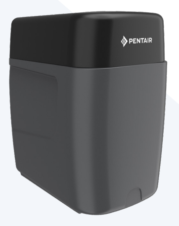
30-gallon atmospheric tank