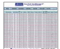
AcuManage II Software