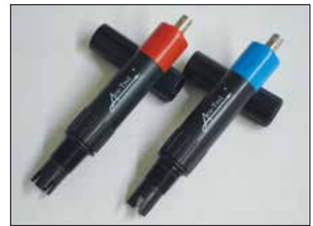
pH and ORP Sensors