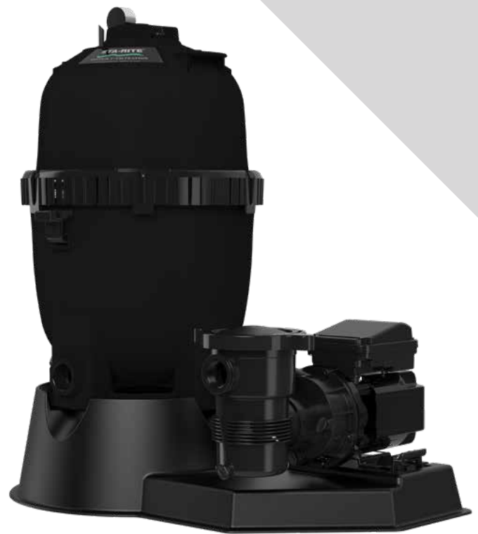
PLD SERIES MOD D.E. ABOVEGROUND SYSTEM