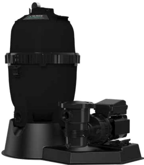
▲ PLD SERIES MOD D.E. ABOVEGROUND SYSTEM

For superior strength, reliability and longevity.