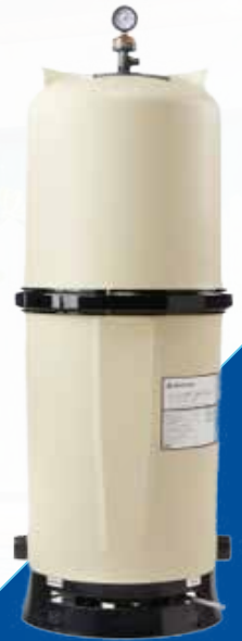
FV60 & FV72 MODELS