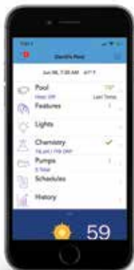
IntelliCenter Mobile Interface