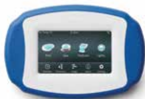
IntelliCenter Wireless Control Panel P/N 522036