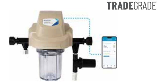
ChemCheck Water Quality Monitoring System

ChemCheck stays one step ahead of pool water chemistry using Oxidation Reduction Performance (ORP). ORP analyzes more than just the amount of chemicals in the water, but also how well those chemicals are performing.