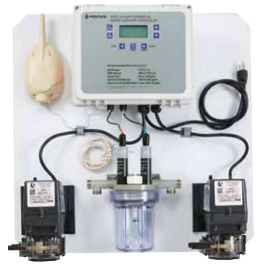
Commercial IntelliChem Chemical Controller