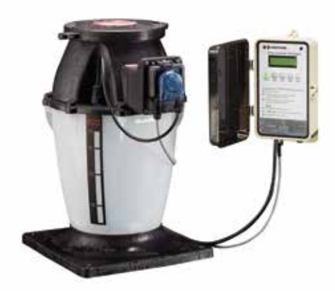
IntellipH Controller Requires IntelliChlor Generator Version 3 (2010 +)