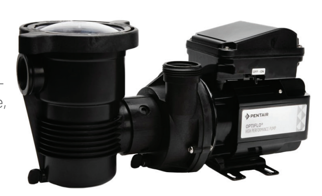
OptiFlo Aboveground Pool Pump

Oh, and it's a summer breeze to maintain. All in all, a waterwise way for aboveground pool owners to remain carefree, and confident well after the regulations take effect.