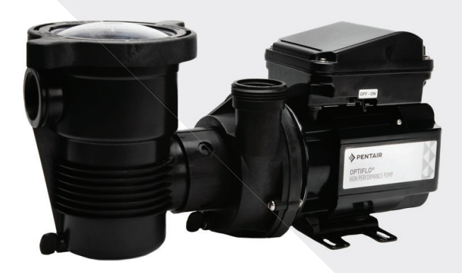
OptiFlo Aboveground Pool Pump

Note: The 3/4 HP OptiFlo, 1.5 HP OptiFlo and all Dynamo pumps represented here are non-compliant products included strictly for comparsion. The new 1.0 THP OptiFlo represents the only series of pumps available for order.