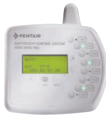
EasyTouch System Wireless Controller