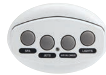
iS4 4-Function Spa-Side Remote