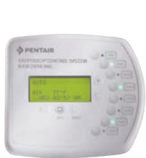
EasyTouch System Indoor Control Panel (4- or 8-Function Control)

EasyTouch Systems are available for a separate spa, a separate pool or a pool/spa combination with shared equipment. You select from systems that control 4-8 accessory functions. Four-function systems are typically used to control pool and/or spa operation plus pool or spa lights and heaters. Eight-function systems allow separate scheduling for additional features, such as landscape lighting, waterfalls, fountains, additional heaters and more. Take the work and worry out of scheduling and operating pool and spa heating, filtration and cleaning cycles. For even greater convenience, you can add any of these optional controllers: