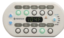
SpaCommand® Spa-Side Remote 10-Function Spa-Side Remote