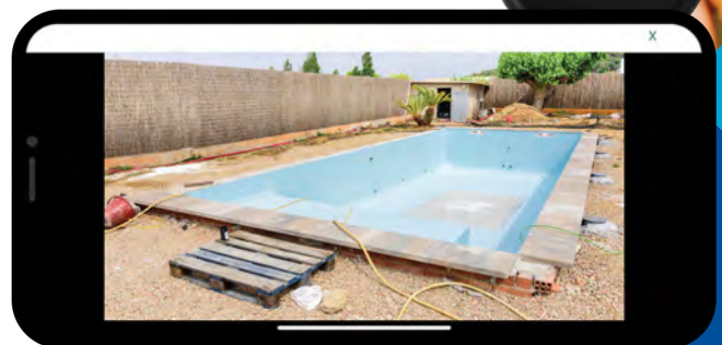
Live View Camera