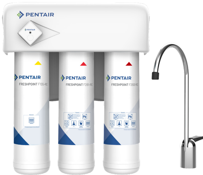
F3000-B2M, (with filter life monitor) shown