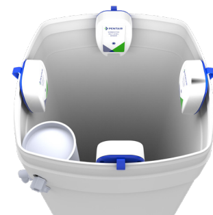
SQUARE BRINE TANK

Note: Visuals above indicate potential positions for the Connected Salt Level Sensor within the brine tank. Only one sensor is needed per brine tank application.