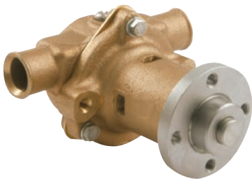
K75 & K75B