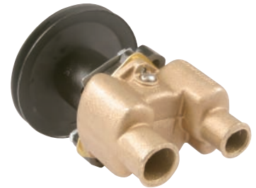
G9901 & G9903*