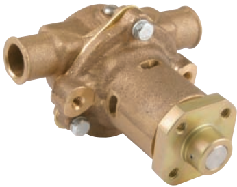
G30-2 & G30-2B