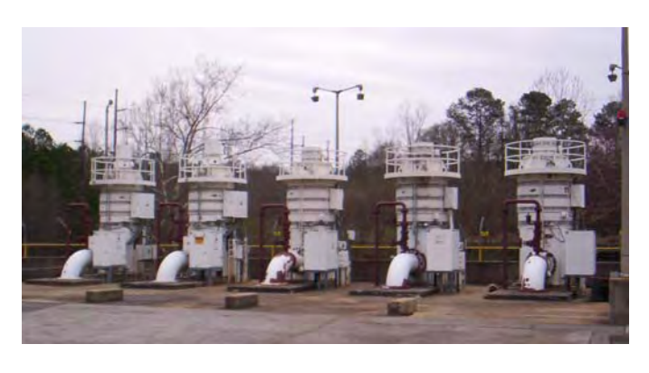
Birmingham, AL 38HOH – 5 stage, 14,000 GPM @ 460' 2000 HP @ 900 RPM Sold by Dowdy & Associates, Inc.