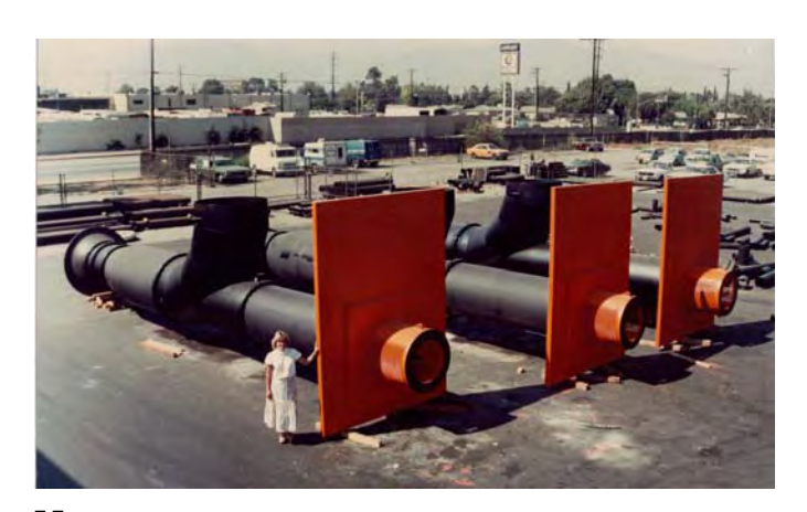
Many, many moons ago... Propeller pumps for an installation in Georgia Sold by General Pump and Machinery, Inc.