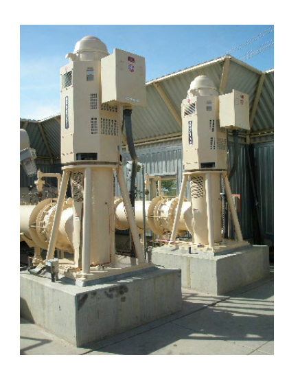
Phoenix, AZ 36GM - 1 stage 15,000 GPM @ 75' 400 HP @ 900 RPM Sold by James, Cooke, & Hobson, Inc.