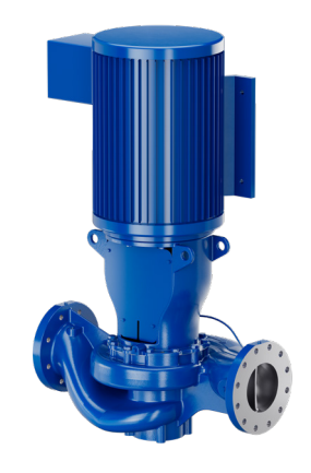
MODEL 382B | Split-Coupled