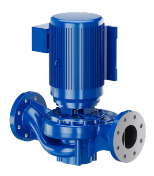
MODEL 382B | Close-Coupled