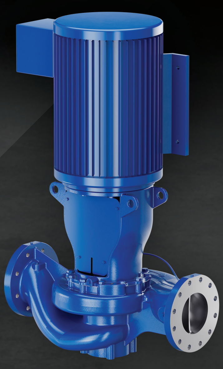
MODEL 382B | Split-Coupled