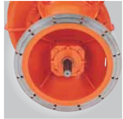
Pre-drilled mounting holes & Severe-duty elastomeric coupling standard