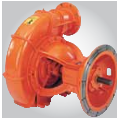
State-of-the-art design & large casting feet