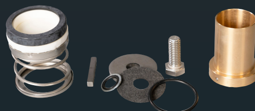
End Suction Repair Kit