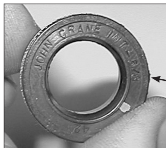
This side mates against the impeller.