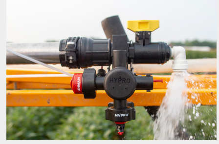
The Push-to-Connect exit provides a variety of connection options including an elbow to direct flow to the ground.