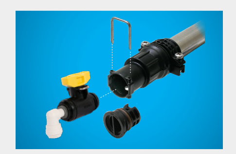
Pentair Hypro Express Flush Valve retrofits to the standard Pentair Hypro Express End Cap and replaces the plug.