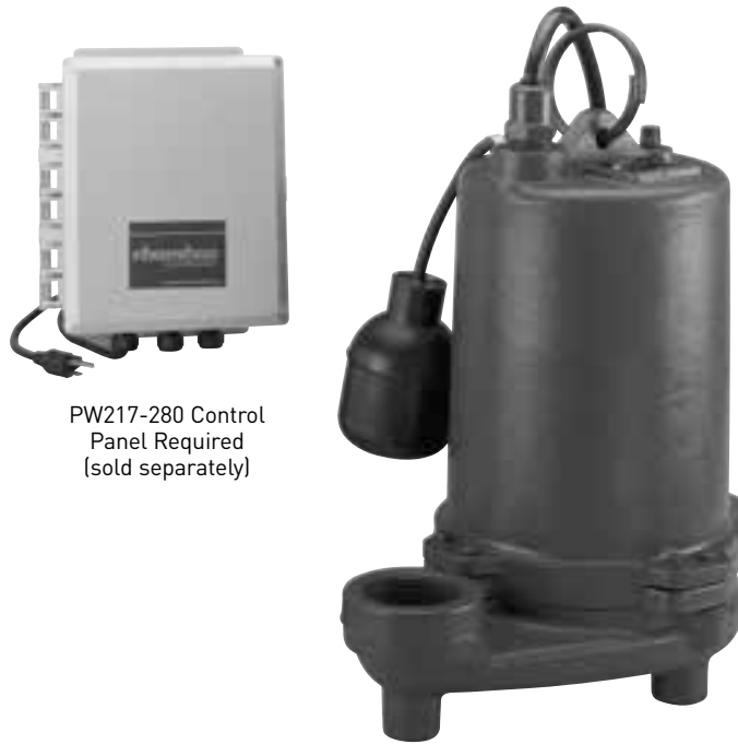
PW217-280 Control Panel Required (sold separately)

The Myers S50HT series high-flow pump is designed for dependability in demanding environments. All cast iron construction and special features to protect the motor make this a pump for the long haul. The S50HT in a boiler blow-down application can withstand liquid temperatures up to 200°F. The non-clogging, semi-open impeller ensures unimpeded flow for high-capacity sump operation.