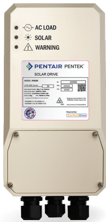
PSD15 1/3 - 1½HP

Pentair is paving the way with an affordable solar solution that is easily integrated into your new or existing water supply system. With Pentair Pentek® Solar Drives, using the sun's energy to power your day-to-day operations has never been simpler. The retrofit plug and play components provide a cost-effective option by allowing you to only purchase components you need to optimize your existing system.