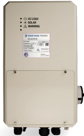
PSD30 1½ - 3HP