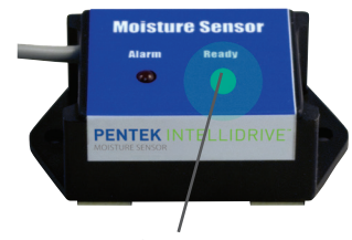
Fig. 3: Green “Ready” indicator illuminated.