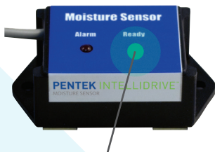
Fig. 1: Green “Ready” indicator illuminated.