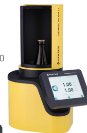
Vos Rota 2.0