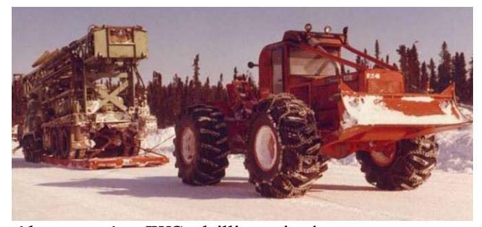
Above – An IWS drilling rig in tow across a frozen lake in northern Saskatchewan, used to drill dewatering holes for a uranium mine.

Layne / Verti-Line had the honor to take part in the Barrie Food Bank Raffle hosted by our Canadian Distributor, International Water Supply (IWS). We donated several prizes to include in the raffle, with ticket sales raising a total of $485 for the Barrie Food Bank.