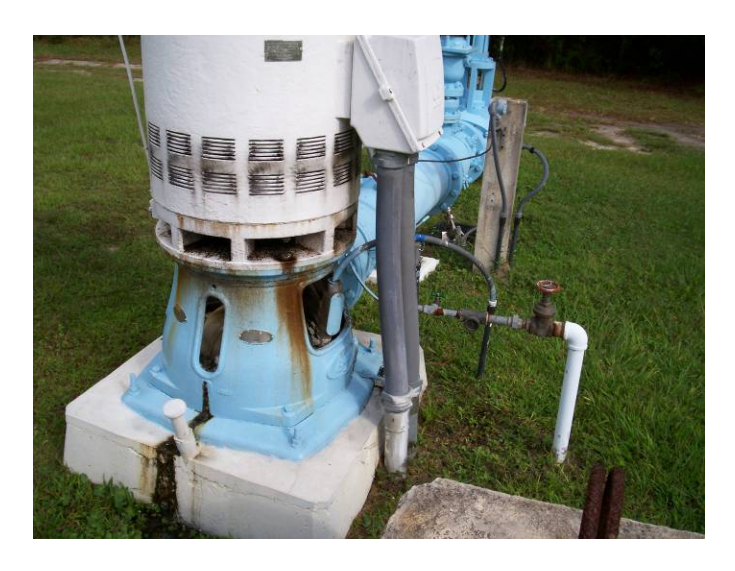
Note the pressurized prelube line (to the right) going to the discharge head.

This is a common question, and the answer use to be simple. In the old days, standard rule of thumb was that if the static water level was less than 50 feet below the discharge head (assuming an above ground discharge where the stuffing box or mechanical seal is located), a pre-lube system was not required. Reasoning behind this was due to the fact that historically vertical turbines almost always employed across-the-line starting. When the pump starts, water rushes up the column and lubricates the lineshaft bearings and stuffing box within a matter of seconds. With acrossthe-line starting and less then 50 feet of static lift, there is no fear of the bearings running dry for too long of a time.