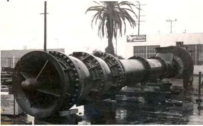
Creole Petroleum Corporation purchased these first 46FHL units and destined them for Venezuela. The service? Pumping crude oil.

1957 -Verti-Line builds one of the largest vertical turbines to come out of their California facility. Though tagged as a model 46FHL, actual bowl and bell diameter measures 53 inches. These 2 stage units produced 28,000 gpm @ 150 ft TDH. Hydraulically balanced zincless bronze impellers provided minimize were to downthrust. The 46FHL design was modeled up from Verti-Line's 12FHL.