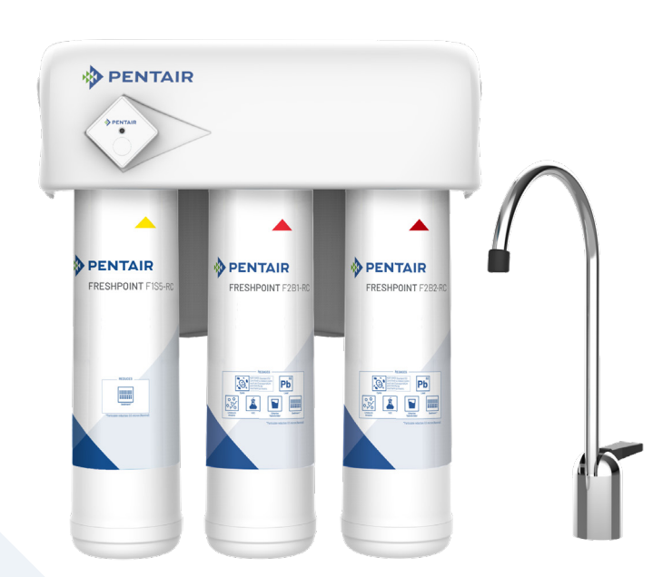
F3000-B2M, (with filter life monitor) shown